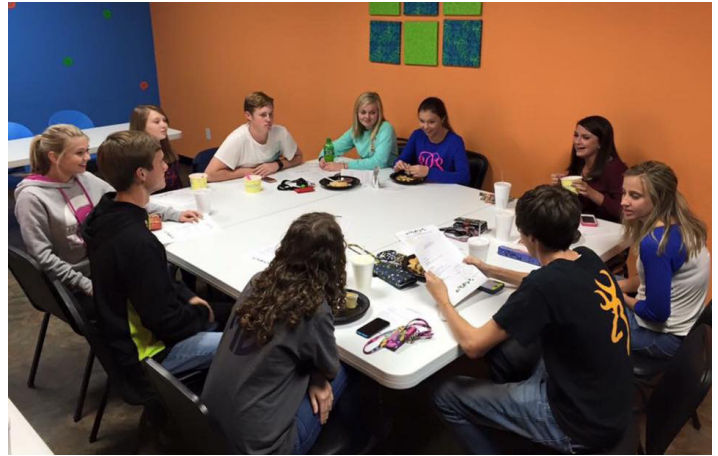
4-H members applied for grants and coordinated with civic groups and government officials as they planned Project Prom.

The Monroe County Sheriff commented that the prom project "... gives me and my officers an opportunity to begin building a positive relationship with our young adults." Parents have shared that in addition to