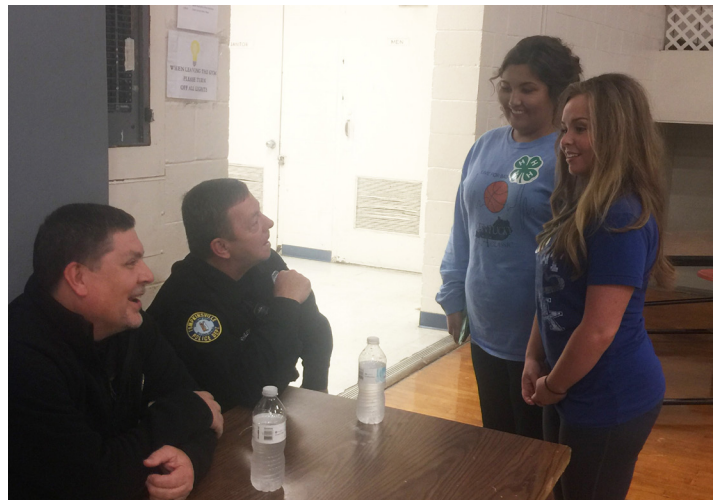
Local law enforcement officials look forward to Project Prom as an opportunity to build positive relationships with young adults.

knowing their teenagers are safe, "... they realize they can have fun without drugs and alcohol." Due to the success of Project Prom, the Monroe County 4-H Teen Leadership club will continue the tradition of promoting safe and healthy lifestyle choices.